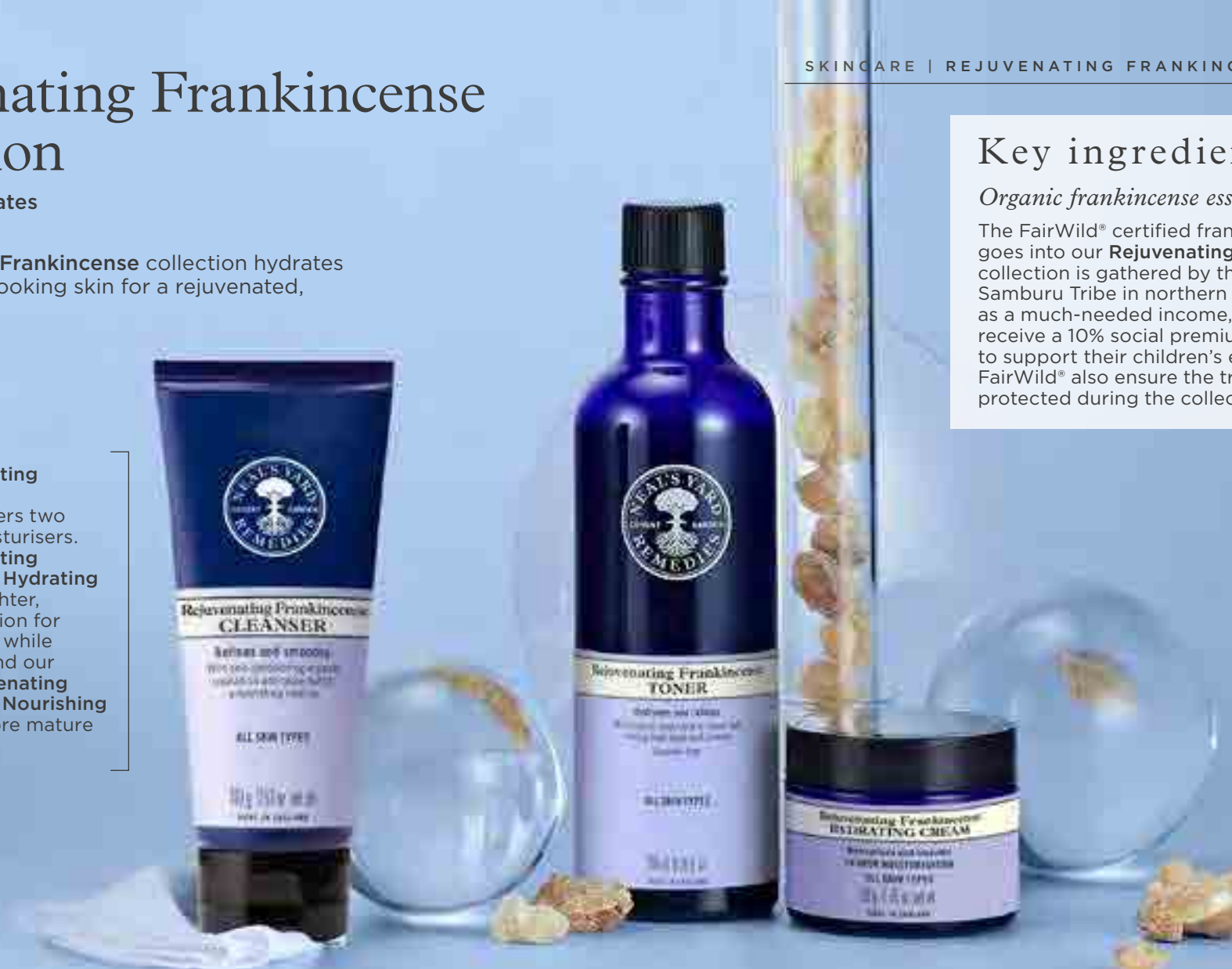
REJUVENATING FRANKINCENSE FACIAL WASH*

The FairWild® certified frankincense that goes into our Rejuvenating Frankincense collection is gathered by the women of the Samburu Tribe in northern Kenya. As well as a much-needed income, the women receive a 10% social premium which helps to support their children's education. FairWild® also ensure the trees are protected during the collection process.