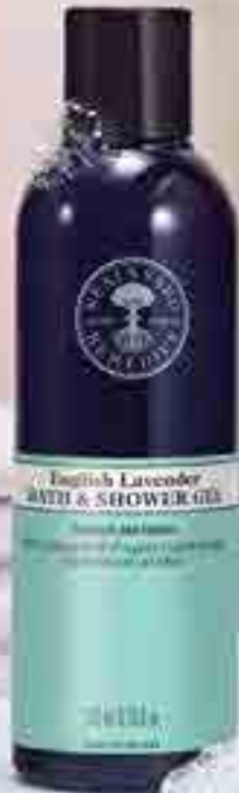
ENGLISH LAVENDER BATH & SHOWER GEL

Our organic English lavender is planted and grown especially for us on a family run farm in the rolling Hampshire countryside.