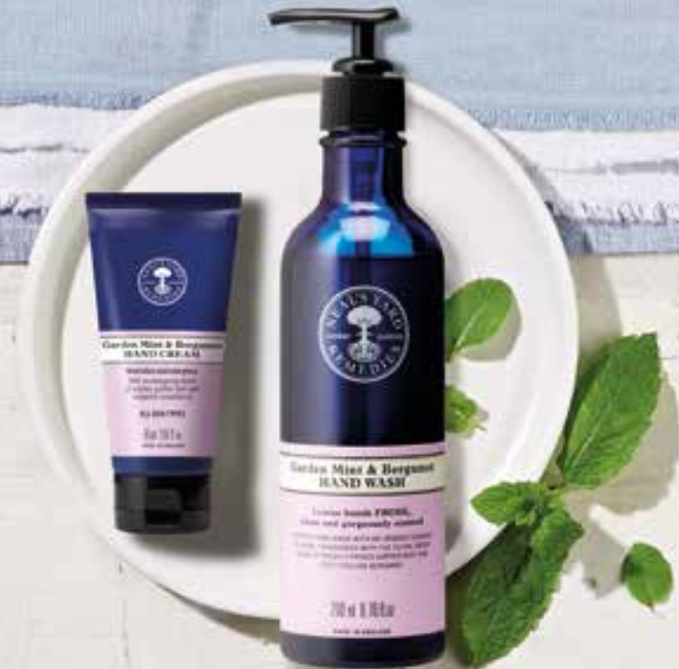
GARDEN MINT & BERGAMOT HAND WASH

Fragranced with the clean, green scent of freshly picked organic garden mint and zesty Sicilian bergamot, our Garden Mint & Bergamot collection is a firm favourite among gardeners and cooks alike.