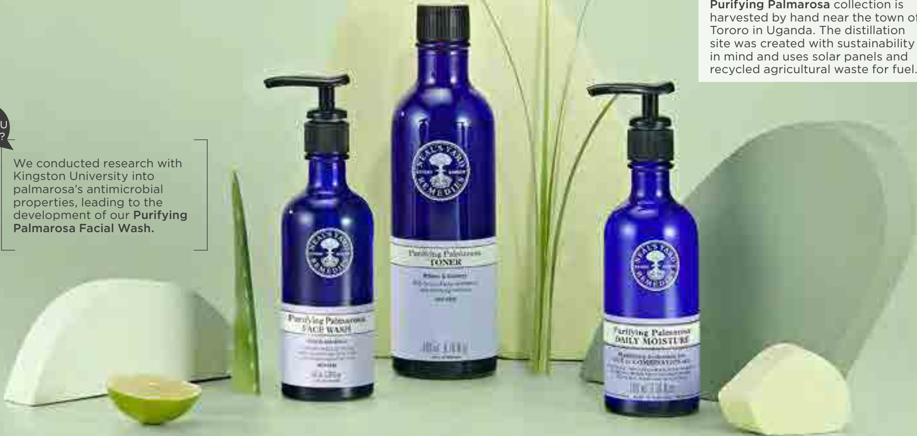
PURIFYING PALMAROSA FACE WASH

We conducted research with Kingston University into palmarosa's antimicrobial properties, leading to the development of our Purifying Palmarosa Facial Wash .