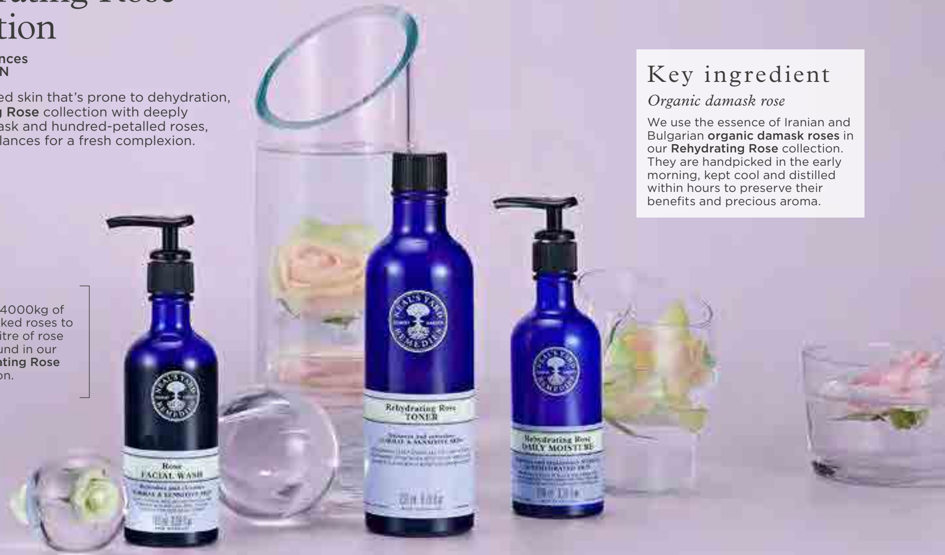
ROSE FACIAL WASH

It takes 4000kg of handpicked roses to make 1 litre of rose otto, found in our Rehydrating Rose collection.