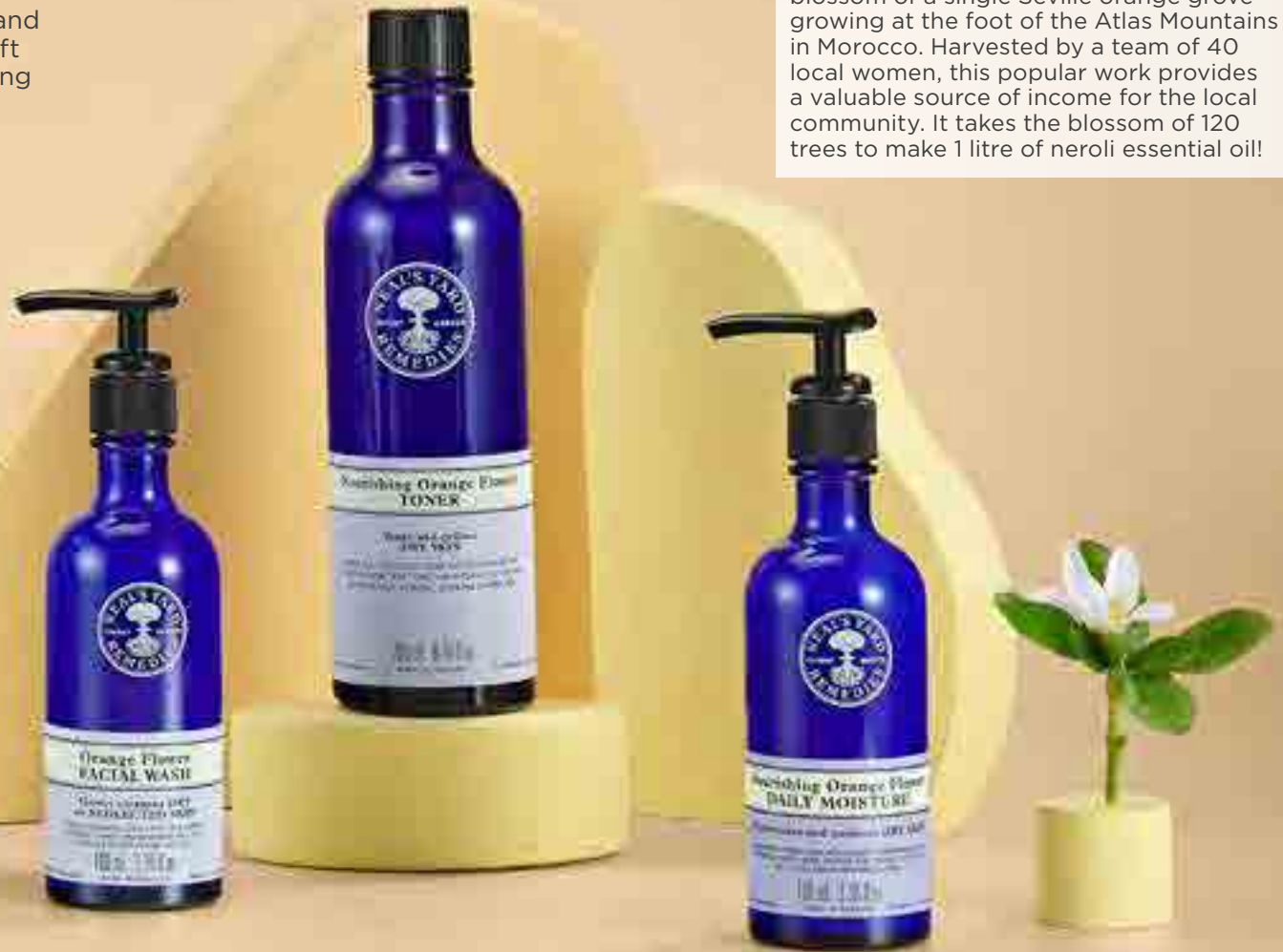
ORANGE FLOWER FACIAL WASH